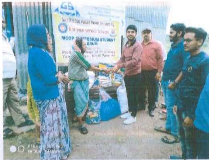
Medicine & Grocery donation to needy Hansen's disease (leprosy) people